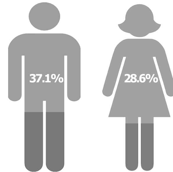
Percentage of employees who received bonus pay